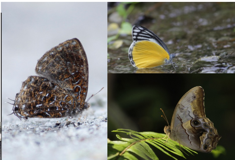
Clockwise from left: Dark Tinsel, Angled Forester & Yellow Jezebel by Brojo Basumatary

A TREE supported the Northeast Butterfly Meet – Season IV, organized in Namprikdang, Dzongu Valley, North Sikkim from 3 rd to 5 th September, 2017 by the Butterflies of North-eastern India group (a Facebook group). The objective of the event was to provide a common platform for butterfly enthusiasts, to discuss and or exchange knowledge on butterfly diversity, range distribution and conservation issues. Apart from these the event aimed to explore lesser known areas with rich butterfly diversity so that an inventory or baseline data of butterfly diversity could