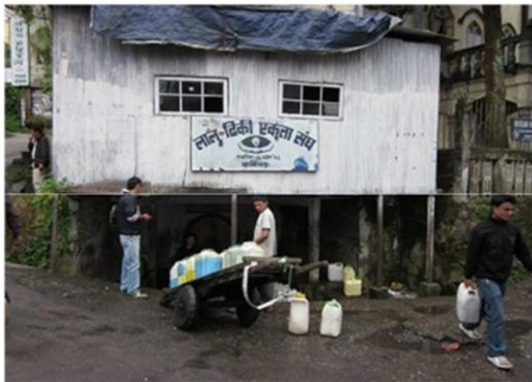
Water distribution from Lal Dhiki spring in Darjeeling

The current Darjeeling urban water infrastructure was meant for a population of only 15,000 people. The same infrastructure more or less exists despite the town population having reached a figure of 120,000+. For the past two decades the town has been under severe drinking water stress especially during the dry periods (December - May). The volume of water in the storage system - which depends on the natural springs within Senchal Wildlife Sanctuary - has decreased drastically due to various factors. These include degradation of forests in the source areas, infestation with invasive species like bamboo, land use changes and probably changes in precipitation patterns being experienced in the hills- longer dry spells with fewer winter rainy days. At present even during monsoon, out of the recorded 26 only 8 springs actively drain into the water storage lakes.