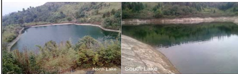
Twins Lake in Senchal Wildlife Sanctuary

geo-spatially, study their hydrology and recharge areas and have in depth knowledge about local management of these vital resources to develop a