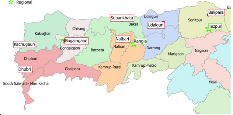
Assam Biodiversity Portal Workshops in Western Assam

platform for the participation of diverse stakeholders in documenting, sharing and using the biodiversity information of Assam. The project will provide an opportunity to researchers, students, practitioners, academicians, policy makers and biodiversity enthusiasts in documenting and disseminating biodiversity related knowledge.