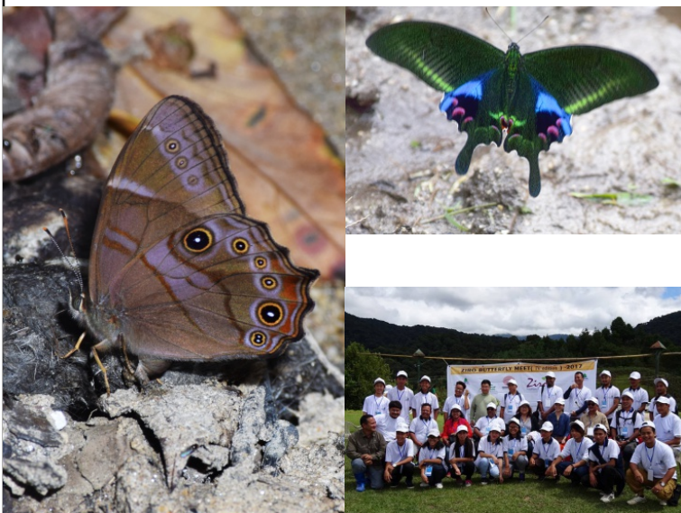
Clockwise from left: Dark Forester, Blue Peacock & Participants at Ziro Butterfly Meet, 2017

A TREE supported the Ziro Butterfly Meet (ZBM) held at Pange, Talle Valley Wildlife Sanctuary, Lower Subansiri district, Arunachal Pradesh from 22 nd to 24 th September, 2017. This is an annual event organized by one of our partners in Ziro Valley - Ngunu Ziro. In this edition of ZBM, the focus was on spreading awareness about butterflies among local youth and providing basic information on observing, identifying and documenting butterflies. The participants at this meet were mainly school and college students particularly from Ziro valley and a few from Yazali, a nearby town.