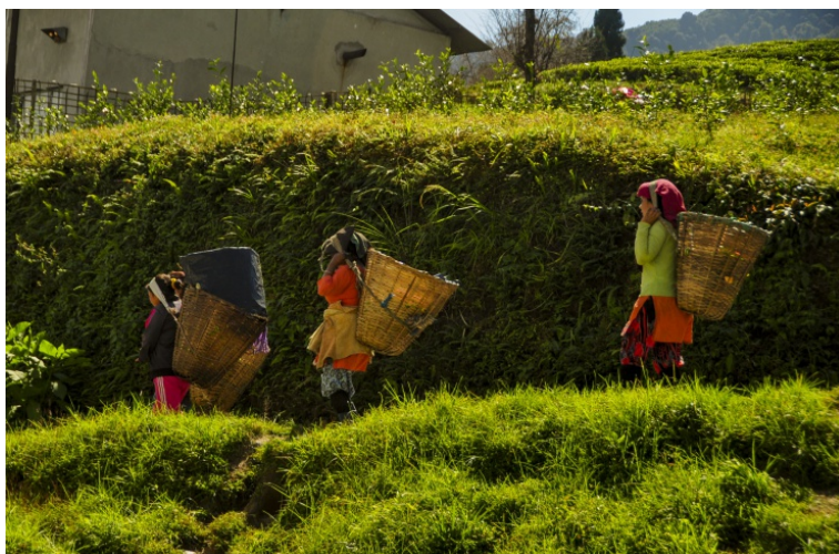
Tea pickers headed to the factory

With the above in mind, we, took up a project in a small catchment in South Sikkim for studying soil dynamics. Soils are a large store of carbon – and the stratum for growing our food. Soil erosion has long been researched from the productivity stand point, the focus now needs to include its contributions as a carbon repository. There is potential for releasing this carbon as atmosphere warming CO 2 as we intensify disturbance with agricultural and infrastructural land use.