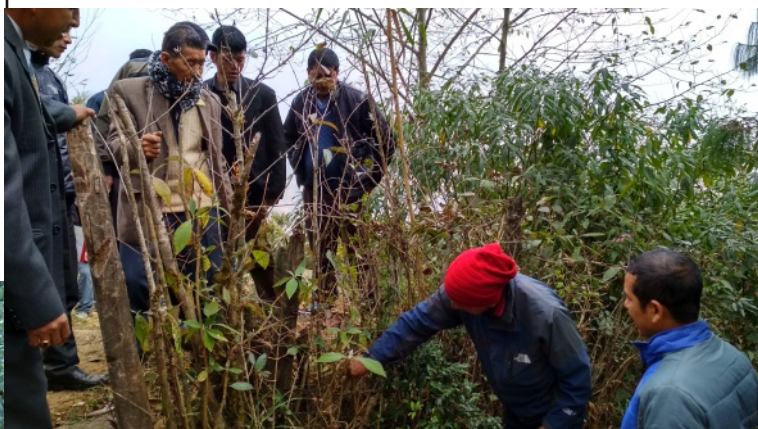
Participants during an interaction session in the field

Villages around Kitam Bird Sanctuary and Barsay Rhododendron Sanctuary in Sikkim have been experiencing intense crop depredation for the past 20 years. Various attempts have been made to mitigate this problem which is adversely impacting the livelihoods of these rural communities. As part of understanding the drivers of this problem especially in the backdrop of climate and other changes we are trying to understand the coping mechanism of the farmers. One of the most popular methods of mitigation is the construction of "live fences" around the perimeter of agriculture land. A knowledge and experience sharing visit was organised for farmers from 7 villages around these protected areas in Sikkim to visit a village in the fringe area of Singalila National Park in the adjacent Darjeeling district. The objectives of the programme were i) to learn and discuss the current mitigation strategy adopted by the community in Darjeeling district along with issues, challenges and potentials of bio fence; ii) to understand the dynamics of convergence among various government departments for mitigation work.