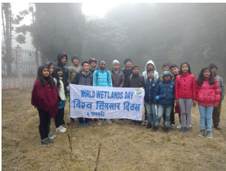
Nature Club member at the Senchel catchment area

Senchel dhāp/sim-sār (Bog, marsh, large expanse of low-lying land) in Darjeeling due to its altitude and strategic location is an important site that has been sustaining the urban populace of Darjeeling supplying water to the entire town. This site, which is also one of the protected areas, plays an important role in trapping and retaining water in several marshlands and moors that form the catchment that eventually feed many perennial streams flowing into the three man-made reservoirs meant to supply water to the entire urban populace of Darjeeling.