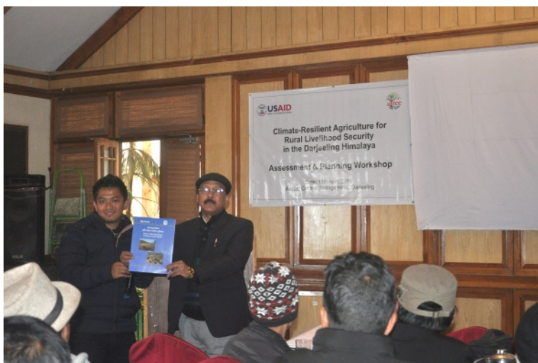
Release of the "Climate Smart Agriculture and Crops Manual"

The Assessment and Planning Workshop on Climate-Resilient Agriculture for Rural Livelihood security in Darjeeling Himalayas was organized by ATREE on 13th April 2018, as part of the Managing India's forest and Bio-diversity for Human Wellbeing Project (FBWB), project supported by USAID. This workshop was organized by ATREE in collaboration with the District Agriculture Department, West Bengal. The Deputy Director, Agriculture Department proactively mobilized the Agriculture Department for their participation and interaction with forty farmers from our project villages and outside.