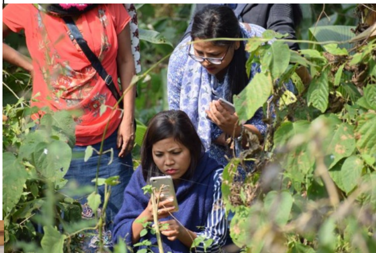
Workshop participants during field sessions

The state of Assam is an integral unit of the Eastern Himalayan Biodiversity Hotspot and the climatic condition and wide variety in physical features in Assam have resulted in the sustenance of wide ranging floral and faunal species. Despite the fact that the biodiversity of Assam is fairly well documented, the information primarily exists in peer reviewed journals, reports and PhD thesis which is difficult to access and utilize. The documentation has involved the scientific research community, but the participation of the general citizenry has not been explored to its full potential even though citizen science initiatives to document biodiversity have been active in the state. Assam Biodiversity Portal is an initiative by ATREE that provides a platform for the participation of diverse stakeholders such as the general public, planners, practitioners and nature enthusiasts in documenting, sharing and using the biodiversity information of Assam.