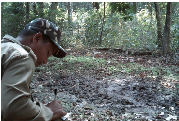
Green Forest Conservation volunteer recording data in the field

After sign survey, a single camera trap was placed in each 2 sq km grid, in a total sampling area covering 34 sq km. Locations were chosen within each grid to maximize the probability of detection while keeping in mind accessibility and security for the cameras. The cameras were kept operational for 24 hours a day and checked at regular intervals. The interesting finding is the first Photographic record of Spotted Deer ( Axis axis ) in Ripu- Chirang Elephant Reserve, which comes under the eastern most range for this species. Other important findings from the camera traps were Leopard, Leopard Cat, Gaur, Elephant, Sambar, Barking deer etc. A detailed analysis of the data will be done subsequently. We expect that this rapid survey will help to create a meaningful conservation intervention in this ecologically sensitive region.