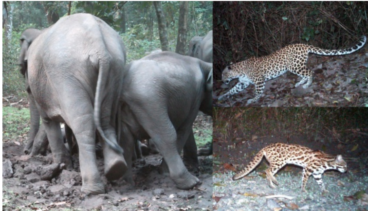
Camera Trap images (clockwise from top left): Indian Elephant ( Elephas maximus ), Leopard ( Panthera pardus ) and Leopard Cat ( Prionailurus bengalensis )

The purpose of this project is to study the presence-absence of different wildlife in Phibsoo Reserved Forest through ATREE, NGO partner "Green Forest Conservation" based in Kachugaon, Kokrajhar District (BTAD) of Assam. This rapid survey is sought to be achieved by using a combination of Cuddeback Attack, Moultrie D-55 Camera Traps. The whole exercise was completed within 50 days. The areas were surveyed for animal signs and records were documented using standard data sheet and GPS.