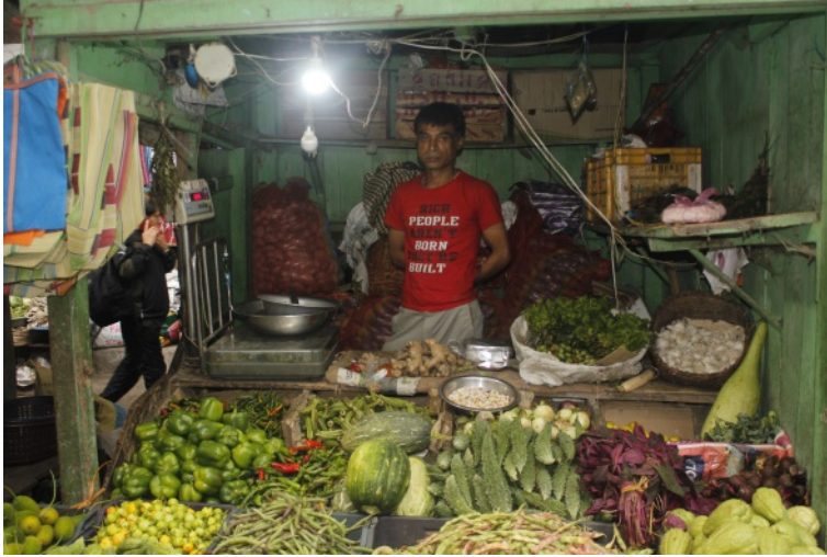
A vendor in Chowk Bazaar, Darjeeling

A rapid assessment of wild edibles was done as part of my summer internship with ATREE. Wild edibles in the mountains and hills are known to contribute to food security, nutrition and sustainable livelihoods of local communities in the rural as well as urban areas of Darjeeling. I assessed the availability of wild edibles from the hawkers and vegetable sellers in Darjeeling town. I divided the town into three parts- upper, middle and lower parts based on localities. 70 sellers of wild edibles were interviewed, and the products currently found in the prevailing season (monsoon) were recorded. The sellers were further divided into three types - vendors, street hawkers and weekly hawkers.