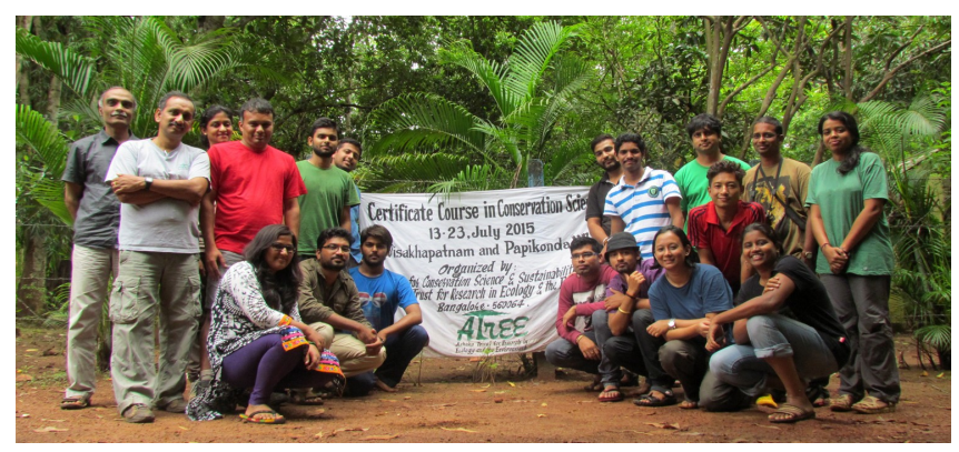
Participants of the conservation science course that was conducted at Maredumilli and Andhra University