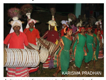
A dance performance by the people of Kova tribe in Maredumilli

Eastern Ghats, rich in biodiversity, relaxing getaway for city dwellers, home to tribal communities, stands out as one of the most beautiful yet neglected part of the region. With the current threats that this fragile landscape is facing and lack of attention from researchers, I wonder if I am being a little too optimistic to hope that these forests will continue giving a similar 'first impressions'. if not a better one, to visitors even 10 years down the line!