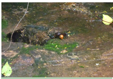
Dillenia pentagyna fruits near the crab's burrow

wide variety of food that come in the form of algae, fungi, small crustaceans etc. Fruit - crustacean interactions is poorly known and mostly reported from riverine ecosystems. Their role as seed dispersers could also be limited since direct intake of plant or fruit matter may occur very rarely. Nevertheless, this observation points to how little we know of the biodiversity of the Eastern Ghats.