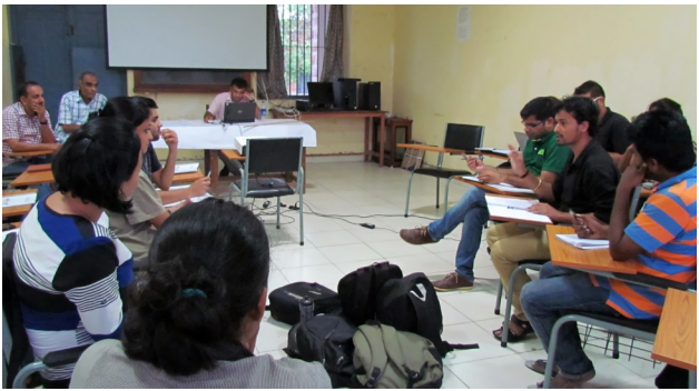
Participants of the Conservation Science course during a debate session organized at the Andhra University, Visakhapatnam

According to me, there are great opportunities to carry out research on the biodiversity related to the Eastern Ghats, and urge everyone to think seriously about its conservation. I thank