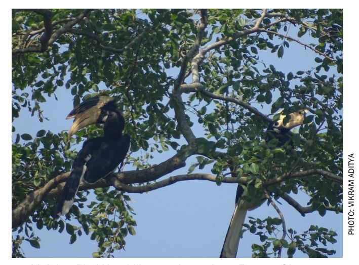
Malabar Pied Hornbills seen in northern Eastern Ghats

birds were spotted during this exercise, including Pale-capped Pigeon Columba punicea (VU), Yellow-throated bulbul Pycnonotus xantholaemus (VU), Black-bellied Tern Sterna acuticauda (EN) and Malabar Pied Hornbill Anthracoceros coronatus (NT). Also, the Critically Endangered Forest Owlet Heteroglaux blewetti was spotted near the park's northern border. From this, the researchers were able to provide a site assessment of the national park and declare it an IBA. However, this fledgling IBA is already in danger, with the most ominous threats including the expansion of nearby commercial plantations, forest fires, hunting, mining and the ongoing construction of Indira Sagar Multipurpose Dam across the Godvari River, which runs close to the park's eastern border.