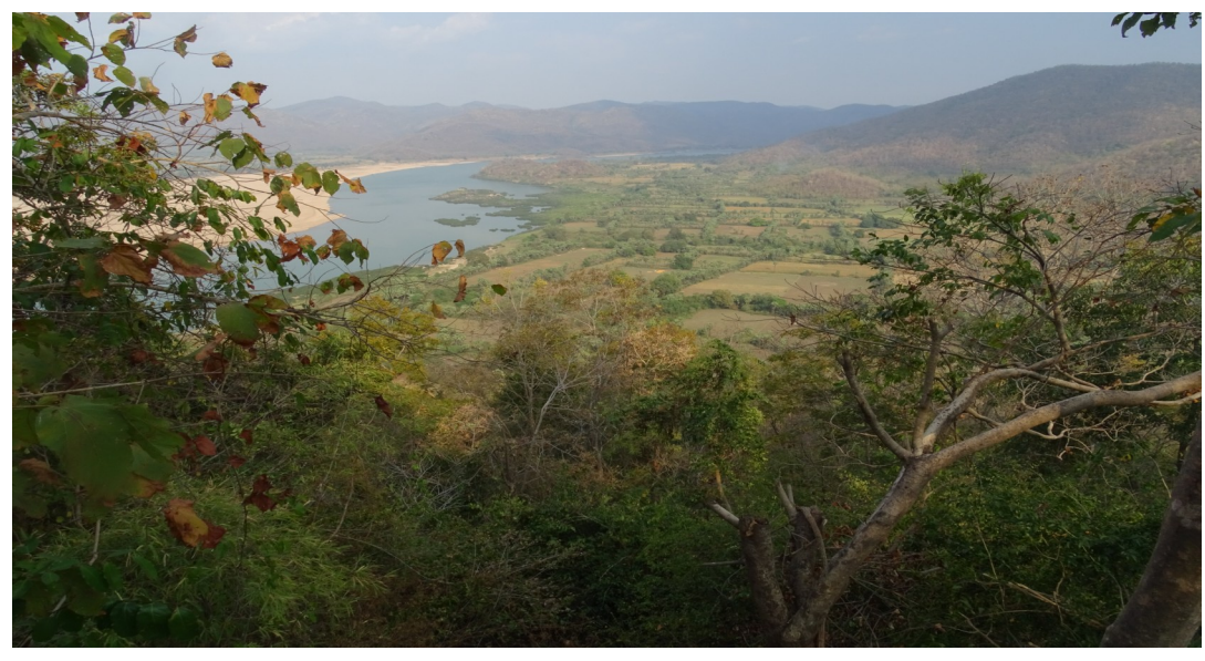
Top: A dam site in the Eastern Ghats. Above: A view of the Godavari from Papikonda NP