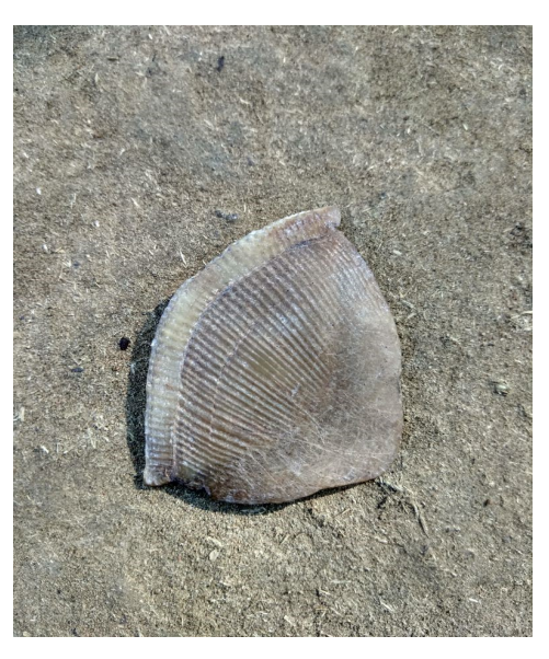
- An image of the scale of a hunted Pangolin in the northern Eastern Ghats

The interesting aspect of the interactions with tribal communities was getting a glimpse at their lives, and how they influence the surroundings. Inquiring elders of the tribal communities, about the pangolin, helped reveal that there is a demand and local market for Pangolins in parts of the Eastern Ghats of northern Andhra Pradesh, Tribals would describe their few encounters with the pangolins, and some admitted to having hunted pangolins for its meat in the past. Tribals claimed that the meat of the Pangolin is a delicacy of sorts. Nothing conclusive although has been identified as to the source of demand for the scales of the Pangolin in the market. Some tribals were aware of the demand for the pangolin and the price it fetched but appeared too hesitant to reveal too much about the