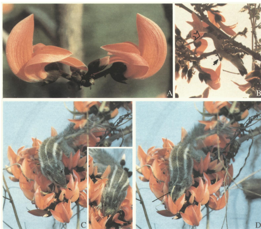
FIG. 2. A, A pair of freshly opened flowers showing erect keel, fully expanded lateral wings and the standard petal. The stamens and the pistil are enveloped in the keel. B, A female purple sunbird (solid arrow) withdrawing nectar from the opening of the keel (unfilled arrow). C, A three-striped squirrel foraging freshly opened flowers. Pollen can be seen as yellow powder (small arrows) on the snout and the head (inset) of the squirrel. D, Squirrel pollinating a flower. Note that the head of the squirrel is in contact with the stigma (long arrow), effecting pollination.

a flower was 52775.49 \pm 1698.03 ( n = 20 ). Whereas each anther of the nine united stamens contained 5382 \pm 340.76 pollen grains, the anther from the free stamen bore a slightly lower number ( 4334.83 \pm 329.22 ). About 37.3 % of pollen grains were sterile. They were shrivelled, lacked cytoplasmic contents and did not fluoresce when stained with FDA. Fertile and viable grains were 28 \pm 1.36 \mu\text{m} in diameter, fluoresced brightly with FDA and contained starch as reserve material (Fig. 1I). Each ovary bore 5.43 \pm 0.6 ( n = 30 ) ovules; and the pollen to ovule ratio was 9719 : 1.